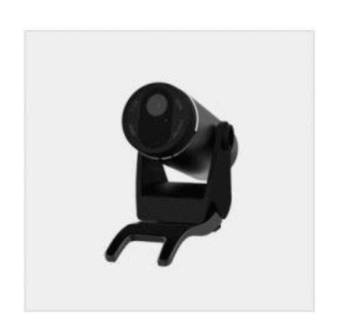
XonTel USB Camera