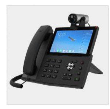
XT-40G Android IP Phone with Camera