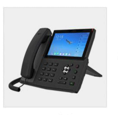
XT-40G Android Touch Screen IP Phone