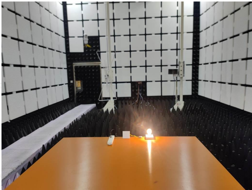
Radiated Emission Below 1 GHz & Above 1 GHz