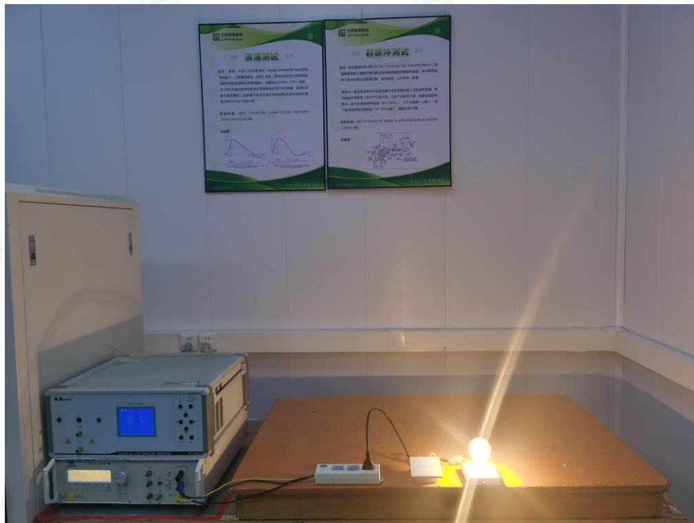
Fast Transients Common Mode