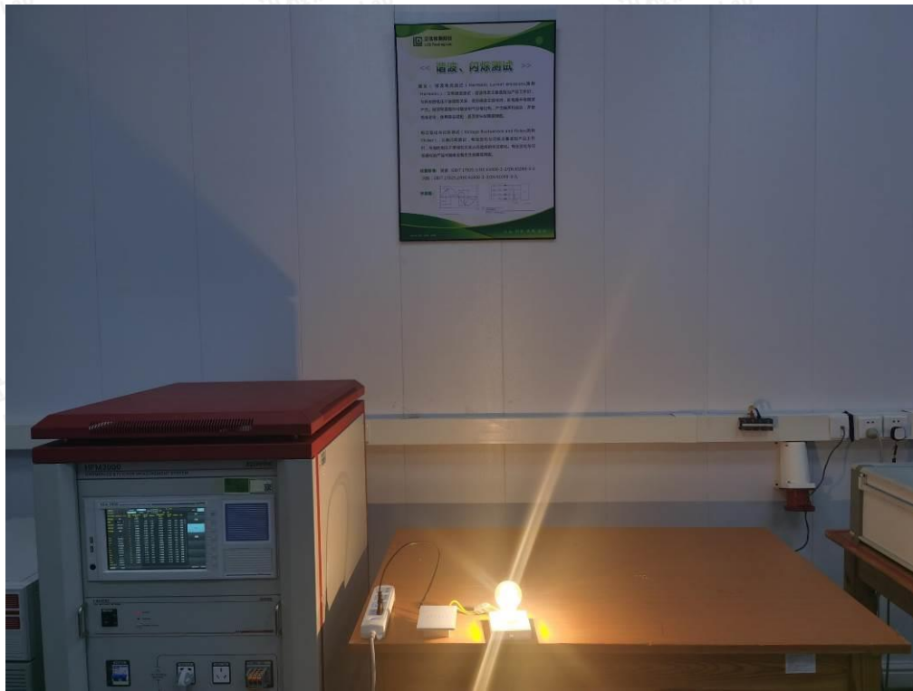
Voltage Fluctuations and Flicker