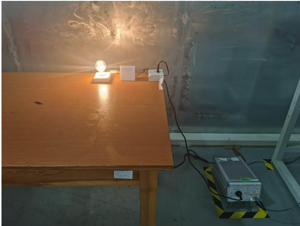
Power Line Conducted Emission