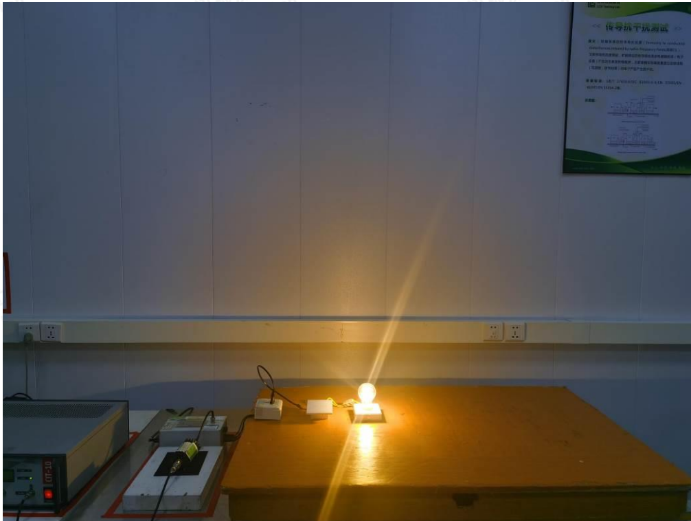
RF Common Mode (0.15 MHz to 80MHz)