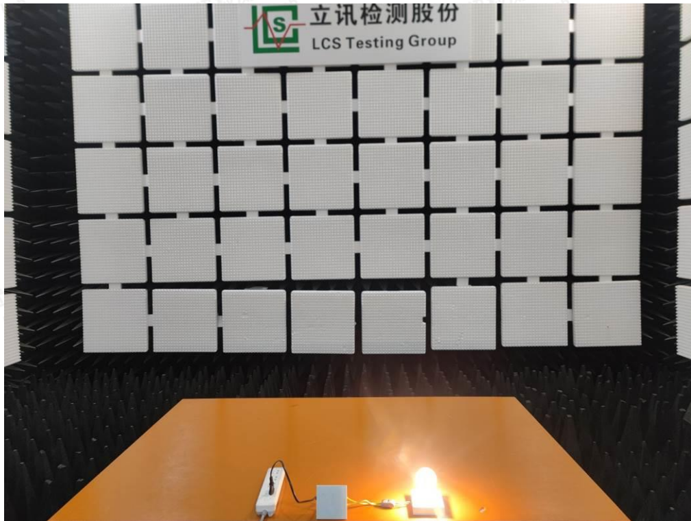
RF Electromagnetic Field (80MHz to 6 000MHz )