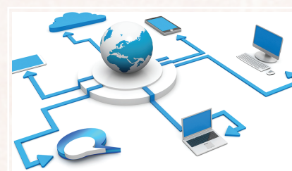
100pcs APs and 250 users